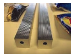
Sealing Bars - Crimp